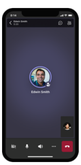
Call moved to Teams